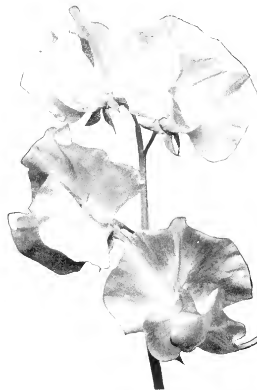
Giant Rose—1/3 Natural Size

GLITTERS —One of the finest of its color, cerise with orange cast. Price: oz. 30c; 4 oz. $1.00; 8 oz. $2.00.